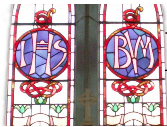
Jesus and Mary Window, Toovahera