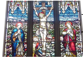
Crucifixion Window, Doolin