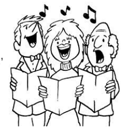
"To sing your prayer is to have prayed twice as well."

Instrumental musicians, of all ages, are also sought to offer their talents to God and his people at Mass. A slow Irish air, for example, can be a wonderful aid to prayer and meditation at the offertory and in thanksgiving after communion. Please contact me if you're interested in getting involved and we'll explore how best to integrate your gifts with the talents of our parish choirs.