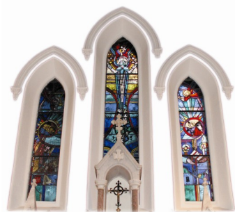
Vocations Window, Kilshanny